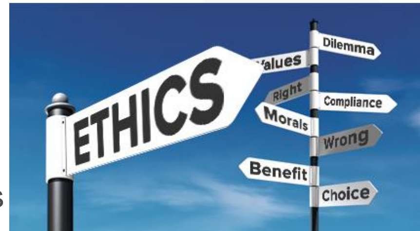
Image by Madhumathi S V. License: CC-BY-SA 4.0 https://commons.wikimedia.org/wiki/File:Business_ethics.jpg